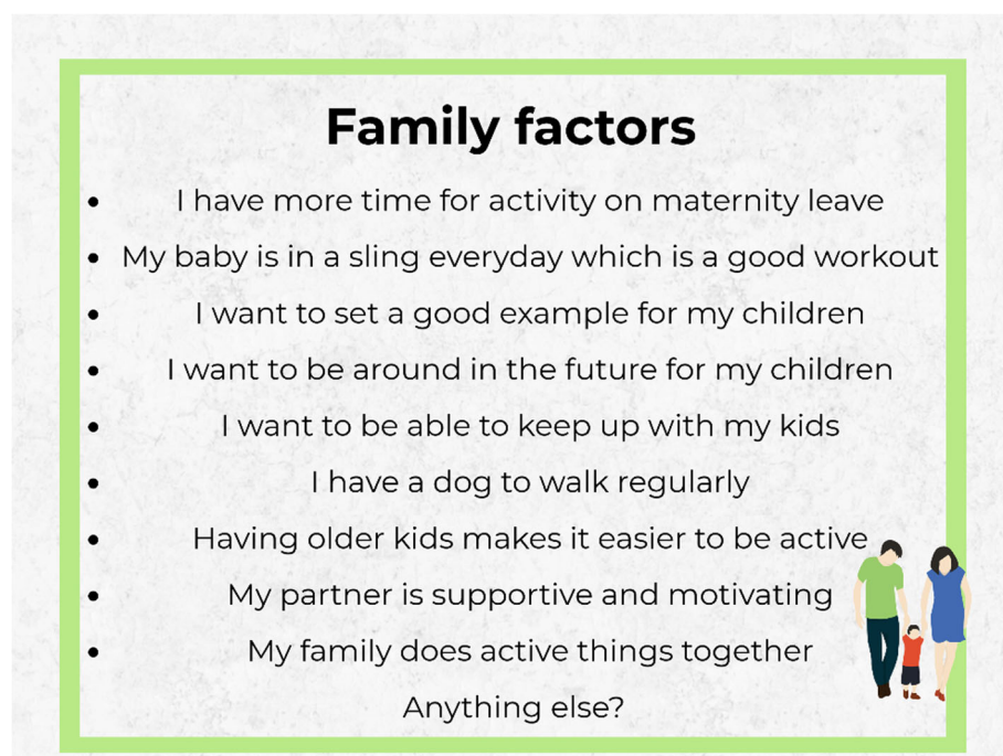
Fig. 1 Example image of family-related facilitators to physical activity (identified during previous interview stage). Participants were asked to comment on the image and list 1–3 factors within this theme that were most important to them

At the end of the workshop, the researcher posted a final message thanking participants for taking part and reminding them to take the survey. However, some participants continued posting in the group after the official end of the study—two shared links relevant to the topic