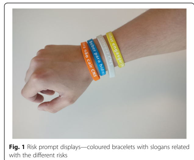
Fig. 1 Risk prompt displays—coloured bracelets with slogans related with the different risks

One member of the research team will hold an initial multidisciplinary teaching session to train and familiarize