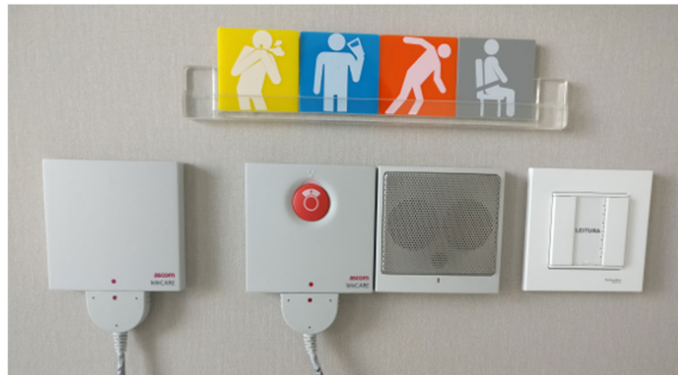
Fig. 2 Risk prompt displays—coloured signposts next to patients' headboard

the CNS multidisciplinary team with the use of sign displays and the corresponding intervention procedures. Training is expected to last 60 min and to be both a theoretical and practical session. It will include explanations of what constitutes a fall, pulmonary aspiration, and dehydration, and will also include specific instructions on which procedures to undertake at each situation of risk. Additionally, the researcher will provide a practical demonstration of the procedure and any queries from the team will be answered.