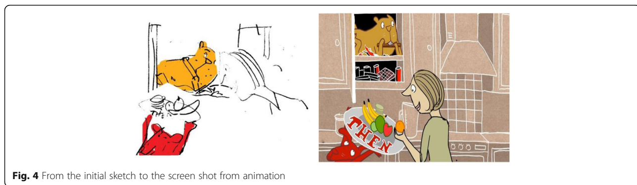
Fig. 4 From the initial sketch to the screen shot from animation

clear. Abstract ideas are explained by simply using key elements of the message (the animator commented that ‘you[researchers] had done a lot of the work to simplify the ideas’) and a plan of explanation that could be translated into messages delivered by the characters (‘everything I did came from the script which you developed yourself’). Iterations of characters, narrative, content and visuals were shown to young children and parents to check the acceptability of the story (e.g. to single parents as well as couples) and the comprehensibility of the messages.