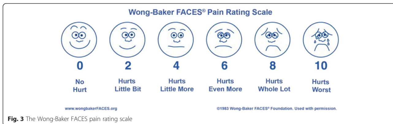
Fig. 3 The Wong-Baker FACES pain rating scale

of surgeon carrying out the operation will also be recorded. Any procedures which might lead to exclusion of the patient from the study (such as insertion of a Kirschner wire) will also be recorded, and the principal investigator for the site will be informed.