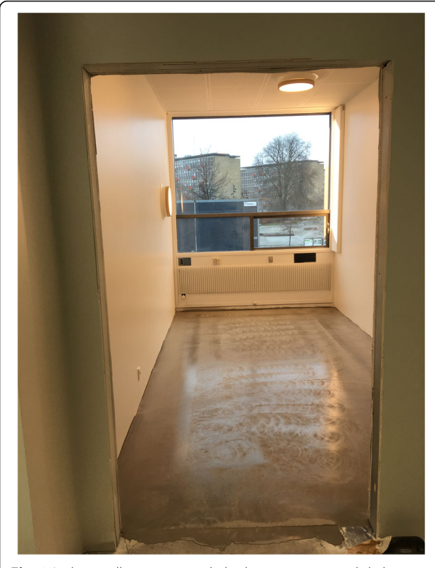
Fig. 2 Light installation in a single-bed patient room with light in dynamic mode

brighter than usual in a patient room. The ceiling luminaires could be turned off/on by the participants as preferred. During the summer, the dynamic LED lighting was brightest between 09:00 and 14:00 and dimmest and warmest from 23: 00 to 06:00. In the winter period, the timings were changed from 09:30 to 13:30 and from 22:30 to 07:00, respectively.