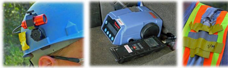
Fig. 1 (From left to right) video camera attached to helmet, dust monitor and video monitor, and safety vest to hold instrumentation

perceptions of the Helmet-CAM, including the potential costs and benefits of using this assessment technology, have not been studied. It is important to understand possible ways with which this new technology can improve worker health to make optimal use of and encourage the adoption of the technology before it is fully integrated into work processes and practices [66]. Although little behavioral research exists around engineering assessment technology, researchers saw an opportunity to help bridge the health communication efforts between workers and mine management using the Helmet-CAM as an intervention tool. However, because researchers had more questions than answers, formative research was necessary to address the feasibility of integrating behavioral research into engineering control mechanisms.